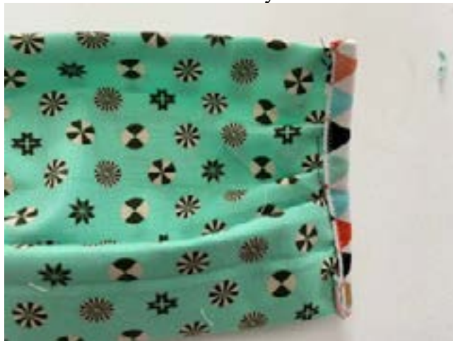
Finished back view