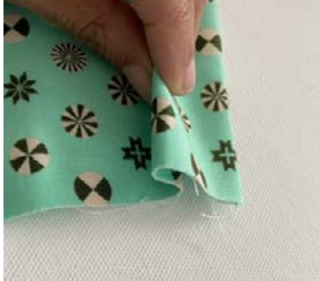
Step 2b-Form 3 pleats on each side. Pin down