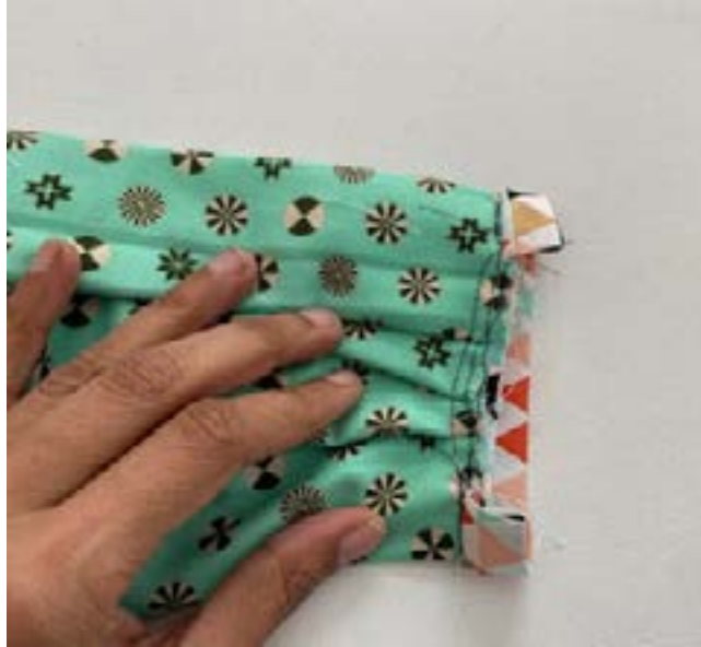
View of the back after you turn it over